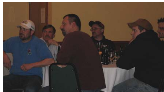
... and listen