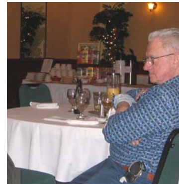
MARA members listen...